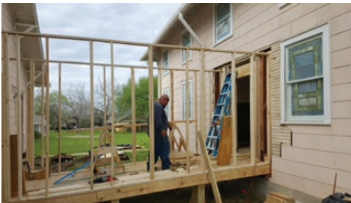
Building the Bridge

The design build project consisted of building a handicap access bridge to connect the existing Church and Annex building; renovating the interior of Annex which was built in the 40's, remodeled in the 70's and in need of complete interior update. The building needed to have ductwork and central air conditioning, insulation in the walls and ceilings, new Men and Womens ADA bathrooms, new electrical wiring throughout the building, demolition and restoration of the interior of the Annex Building. R3group tx is working hand in hand with the Board to restore the property back to its original state.