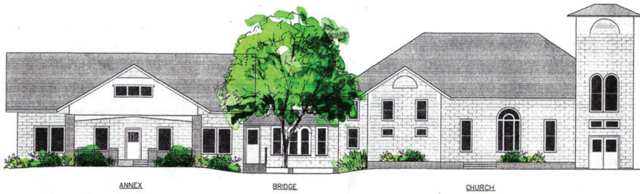
Elevation Concept Drawing

The design build project consisted of building a handicap access bridge to connect the existing Church and Annex building; renovating the interior of Annex which was built in the 40's, remodeled in the 70's and in need of complete interior update. The building needed to have ductwork and central air conditioning, insulation in the walls and ceilings, new Men and Womens ADA bathrooms, new electrical wiring throughout the building, demolition and restoration of the interior of the Annex Building. R3group tx is working hand in hand with the Board to restore the property back to its original state.